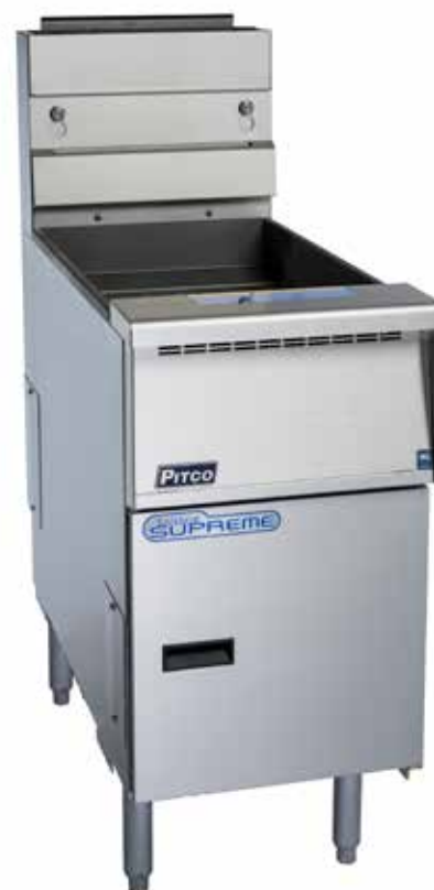
Solid State Control option shown

Note: The controller style must be specified when ordering. Standard fryers come with one type only.